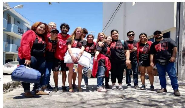
13 of our 14 Mazatlán visitors coming in 10 days.

coming to Peru. This group has people from USA, Mexico, Chile, Belize, Sweden, Perú and Venezuela. We look forward to their arrival. One of their group will be teaching that week, another offering to translate, still another helping cook, and the rest will help us with needed items around the mission. We will all do discipleship to the villages together. We look forward to that visit.