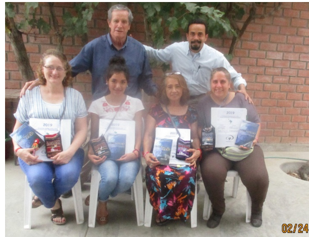
YWAM Ica DTS class gets underway