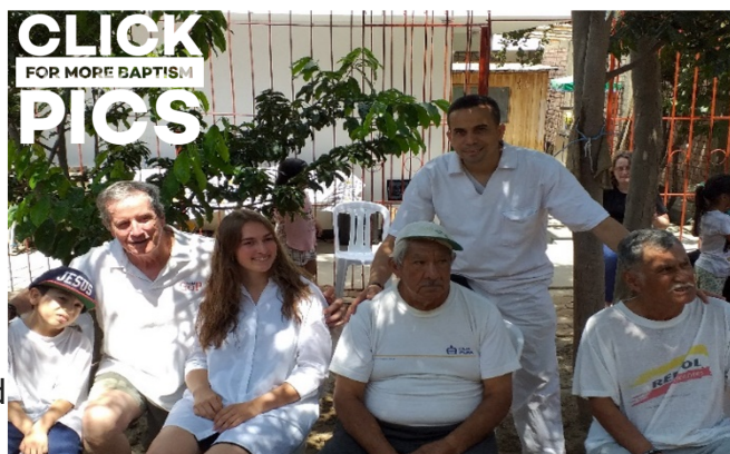
4 people to get baptized and 2 to do the dunking