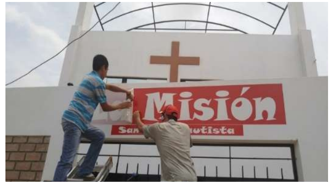
2016 - Adding signage to the Mission

"La Misión" . We wanted to sound as non-denominational as possible, and at the same