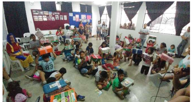
2018 Samaritans Purse gathering at la Mision

With YWAM, we found that we were very much (from a mission standpoint) in harmony with their non-denominational leanings, working along-side multiple churches, and focus of bringing young and older missionaries to assist in areas of need. (Construction, evangelism, youth, teens, bible teaching, etc.).