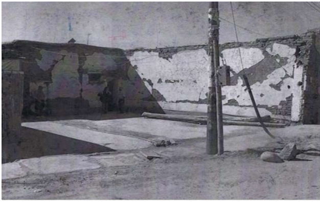
2010 El Carmen donated property

Although we took many trips to Peru to get to know my wife's extended family and culture before 2007 , our travels down to this beautiful country greatly increased after the devastating 8.0 earthquake of that year.