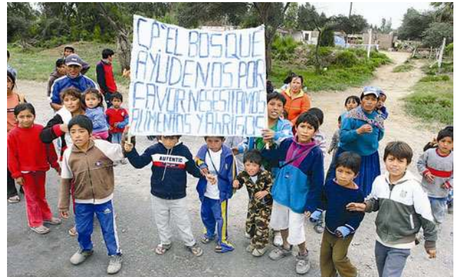
2007 Earthquake - Ica, Peru